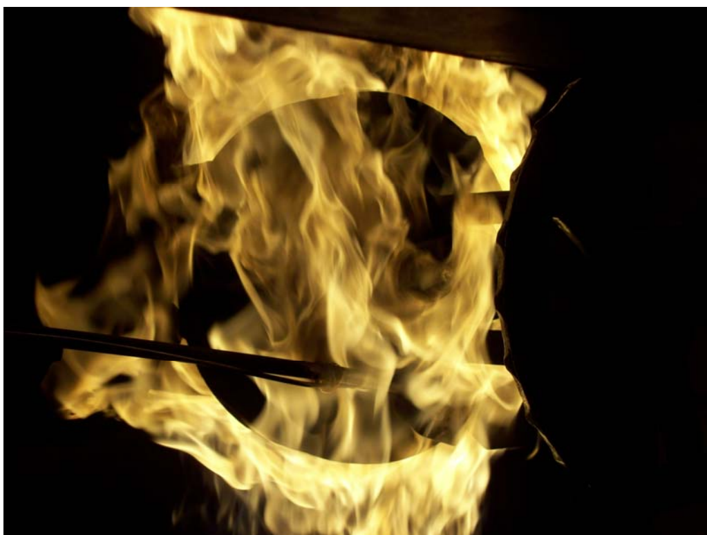
Valve During Burn.