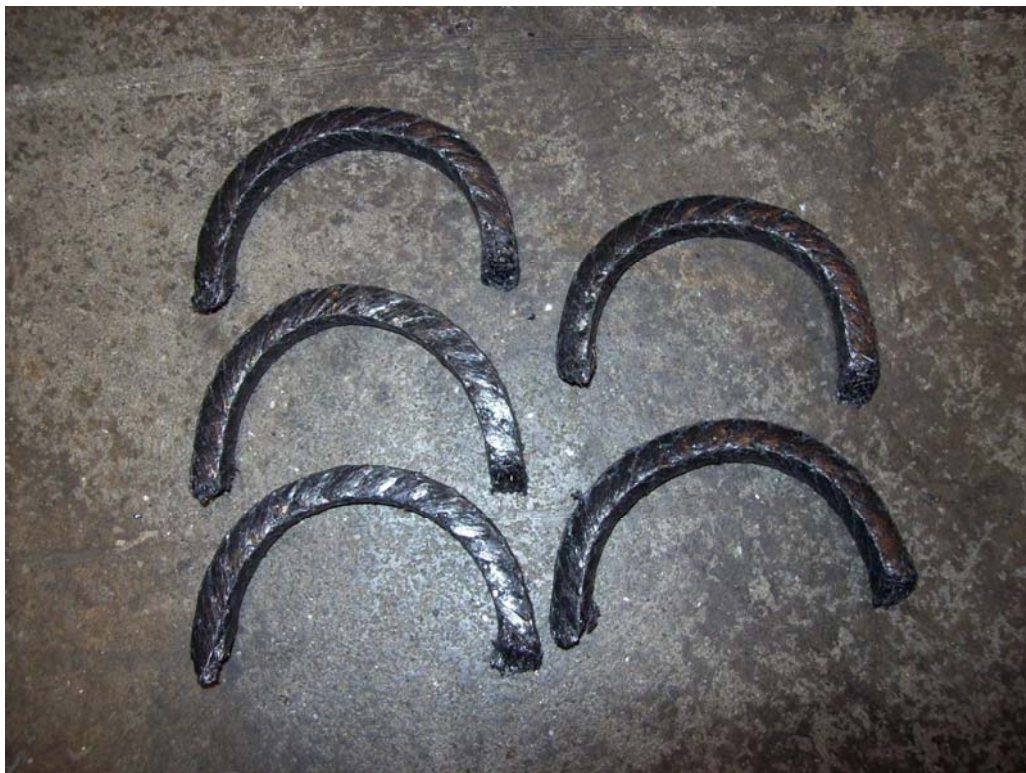
Packing Prior to Test